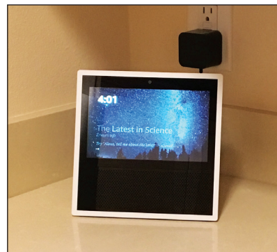
Video Monitor. A wide range of apps for your tablet can also act as a telephone and allow the resident to enjoy face-to-face video chats.

The Tamalpais Smart Home enables a resident to use an iPad as well as voice activation to control lights, shades, television, music and the thermostat. Residents can also use their phone video monitor as well as “Alexa” to call other residents, the Maintenance Department and Reception.