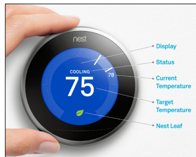
The Nest Learning Thermostat. Easy Temperature Control for Every Room in Your House.