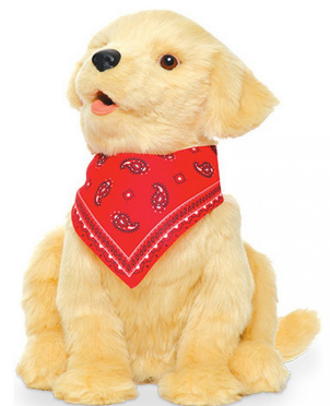
Robotic Smart Pet