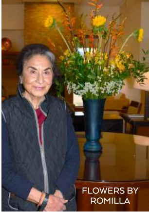
FLOWERS BY ROMILLA

Tam Residents Happy Hour in the Lounge: on the 1st & 3rd Friday of every month.